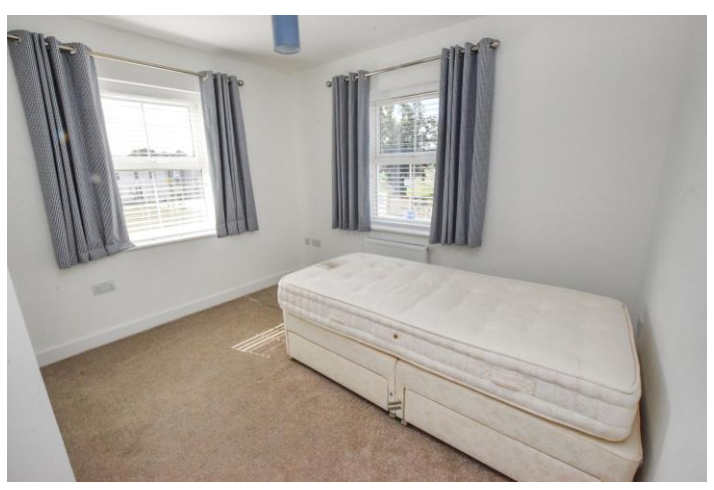
Bedroom Five 9' 3" x 6' 10" (2.807m x 2.077m) Rear aspect uPVC double glazed window. TV point. Radiator.

Dual aspect uPVC double glazed windows. Built in double wardrobe with hanging space and shelving. Radiator. TV point.