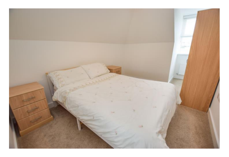
Bedroom Four 11' 2" x 8' 7" (3.407m x 2.610m) Front aspect uPVC double glazed window. Radiator.

Front aspect uPVC double glazed window. TV point. Radiator.